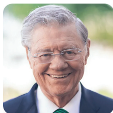
Tom Monaghan Founder, Domino's Pizza