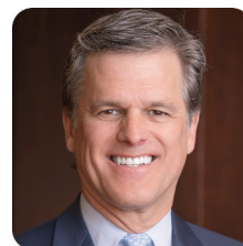
Tim Shriver Chairman of the Special Olympics