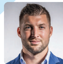
Tim Tebow Founder, Tim Tebow Foundation; College Football Analyst, ESPN and SEC Network; Former NFL Quarterback